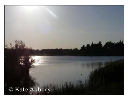
Kemerton Lake at dusk

Thanks to another generous grant from Natural England through the ALSF, we received funding earlier this year to create a large new ride in the Arboretum.