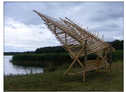
Moonseat at Kemerton Lake

strelle, noctule, brown longeared, lesser horseshoe and Natterer's.