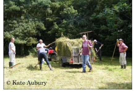
Our work party volunteers hard at work in Richards Wood, June 2009

In the latest session, we were hay raking in two glades in Richards Wood. There's a lot of habitat value in keeping glades open for insects and margin butterflies such as ringlets and