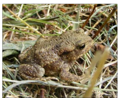
Common toad Bufo bufo