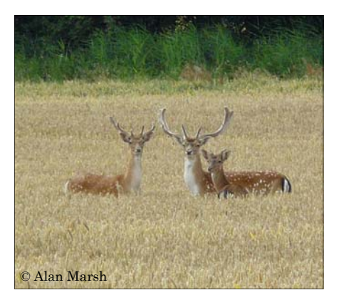
Fallow Deer on the Estate

I have not experienced a worst job but the most challenging element has been the weather, be it completing tasks when it's -10°C or in torrential rain. (I'd rate chipping a thorny hedgerow for 2 days as the worst job so far!—Ed).