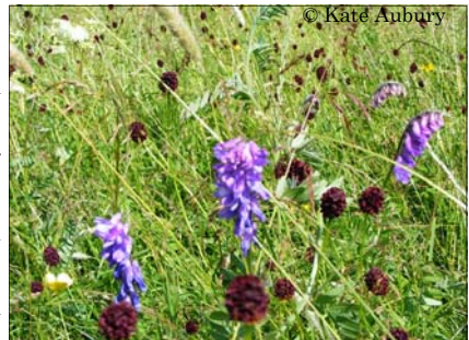
A profusion of wildflowers including Greater Burnet, June 2009

old "Lammas Meadow" system, dating from the Norman Conquest. Lammas meadows are shut up for hay in early spring, cropped in July, and grazed after Lammas Day on 1st August. Nutrients are supplied by flooding episodes in winter. This unique system results in extremely rich meadow flora in late spring/early summer, dominated by the maroon flowered greater burnet in June and also provides nesting habitat for curlews and skylarks.