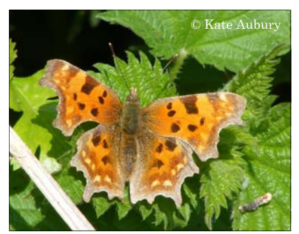
Comma Butterfly Polygonia c-album