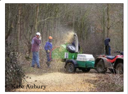
Work party volunteers chip wood on the new ride, Feb 2009

We continue to work hard to beautiful lake and are rewarded by such sights as the hundreds of orchids this year; bee orchids, southern marsh orchids and pyramidal orchids all flowering in profusion around the lake.